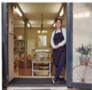
d. Being my own boss.