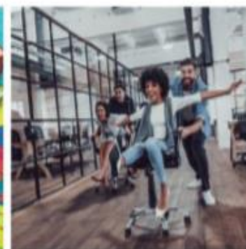
f. Having fun.