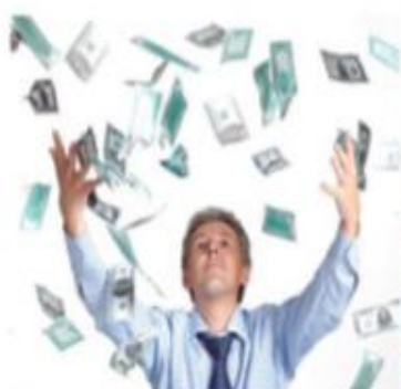
a. Having a good salary.