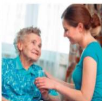
b. Helping people.