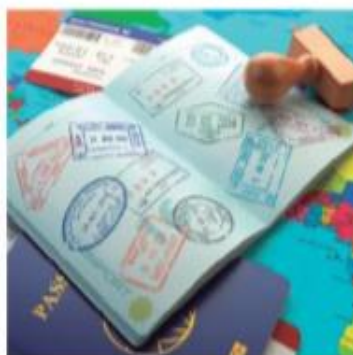
e. Traveling around the world.